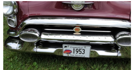
Left to right: 1937 Graham, 1910 Mitchell, 1953 Oldsmobile