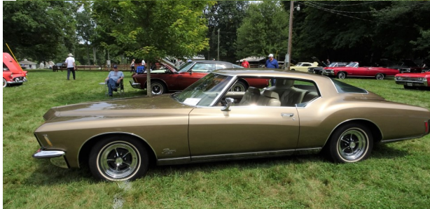
Left: One of the three Buick "Boattail" Rivieras at VMM 54