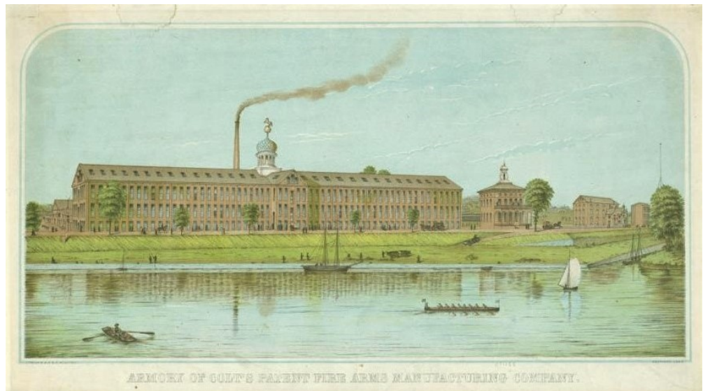
Right: Lithograph of Colt Armory, ca. 1840-1848

AACA's Hornets Nest Region Cancels Spring AutoFair - Yet another sign that we have a ways to go before things return to normal in the antique car hobby, the annual event at Charlotte Motor Speedway in North Carolina, which was originally planned for April 8-11, has been canceled. The club still plans to hold its Fall AutoFair event at the track on September 9-11.