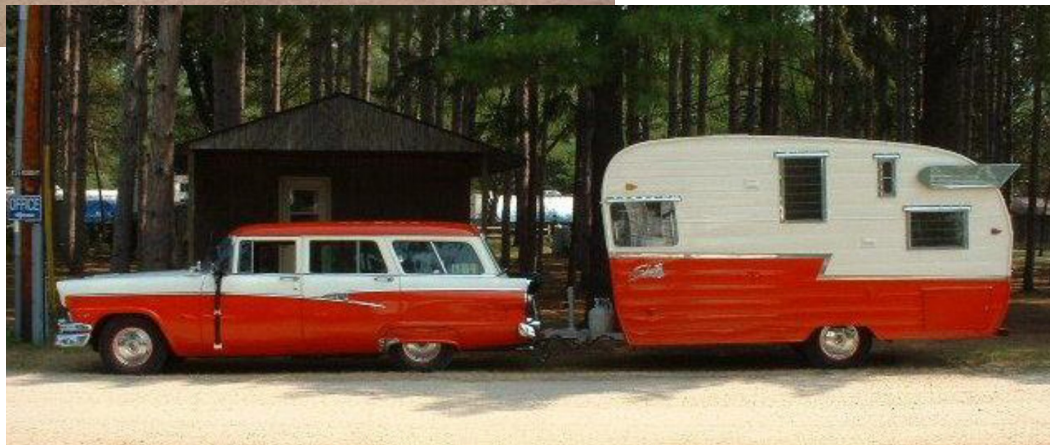
Below: 1956 Ford Customline wagon with matching Shasta trailer