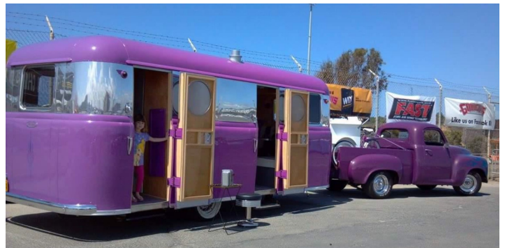
1949 Studebaker Pickup with matching purple trailer