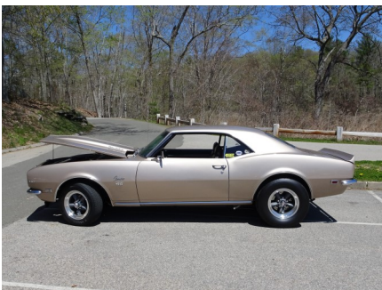
Our Drive to Gillette attracted a few non-member cars, including a Mosport Green C2 Corvette, a 1934 Studebaker sedan (center right) and a sharp 1968 Camaro coupe (left).