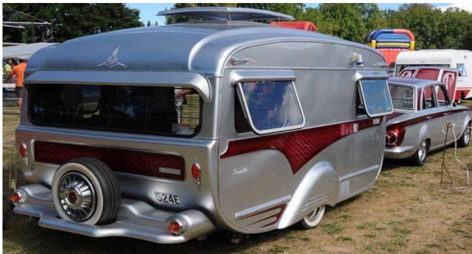
Left: 1962 Ford Cortina with matching custom travel trailer