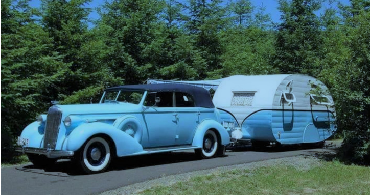
1935 Pontiac with turquoise Canned Ham