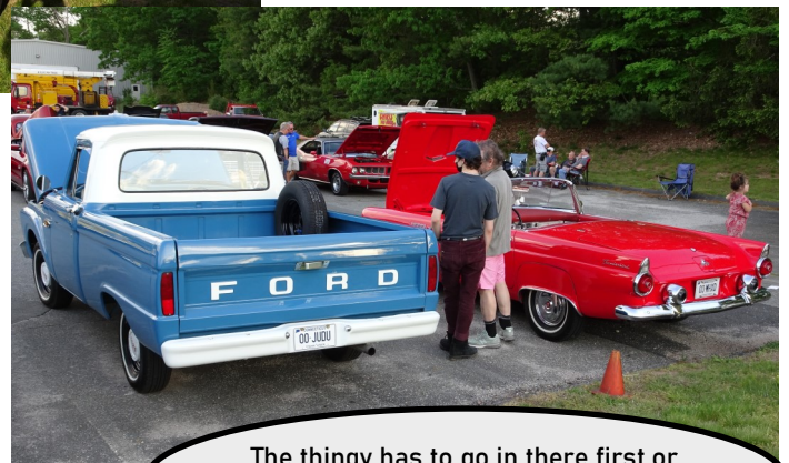
The thingy has to go in there first or the clutch ain't gonna work, see?