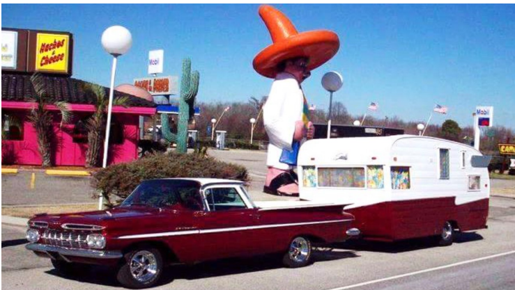
1959 Chevrolet El Camino with matching Shasta trailer