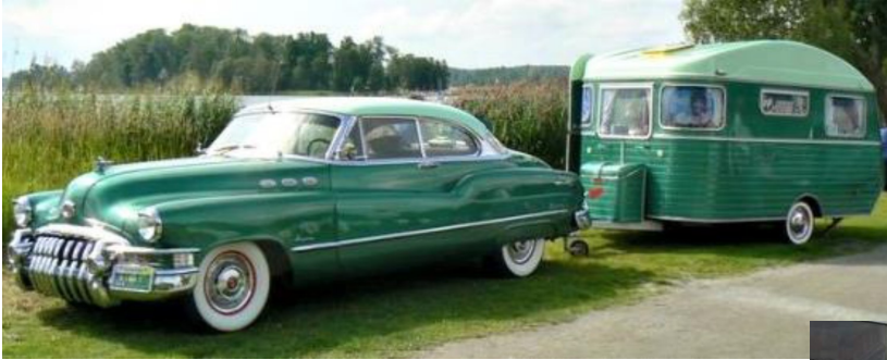
Left: 1952 Buick Riviera hardtop with matching two-tone green trailer