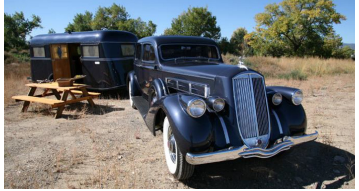
1936 Pierce-Arrow with Travelodge