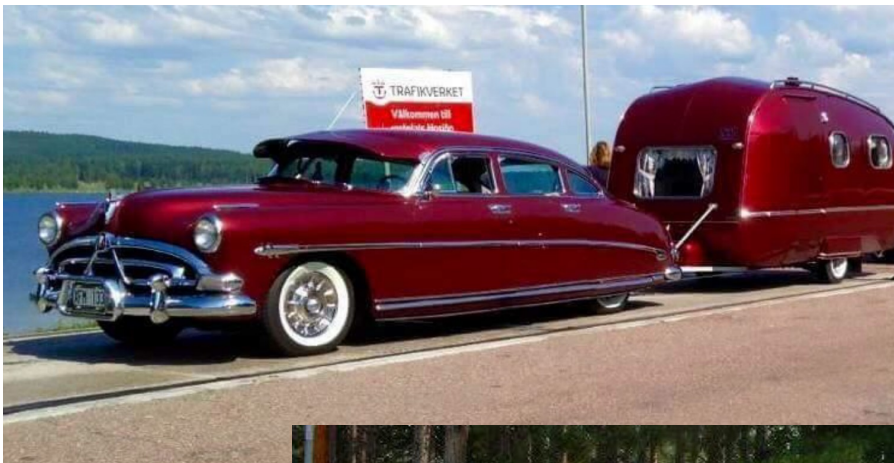
Left: 1951 Hudson Commodore with matching burgundy trailer