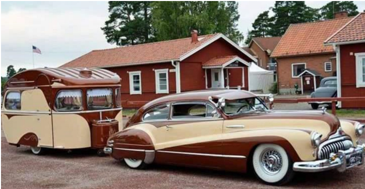
1947 Buick Sedanet custom with matching trailer