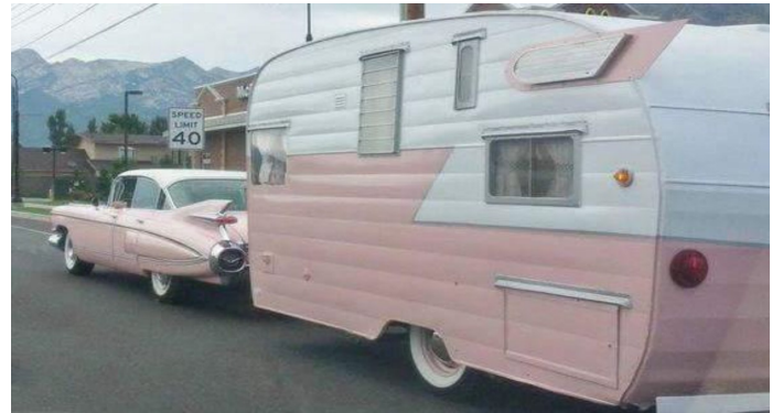
1959 Cadillac Sedan DeVille with matching Shasta trailer