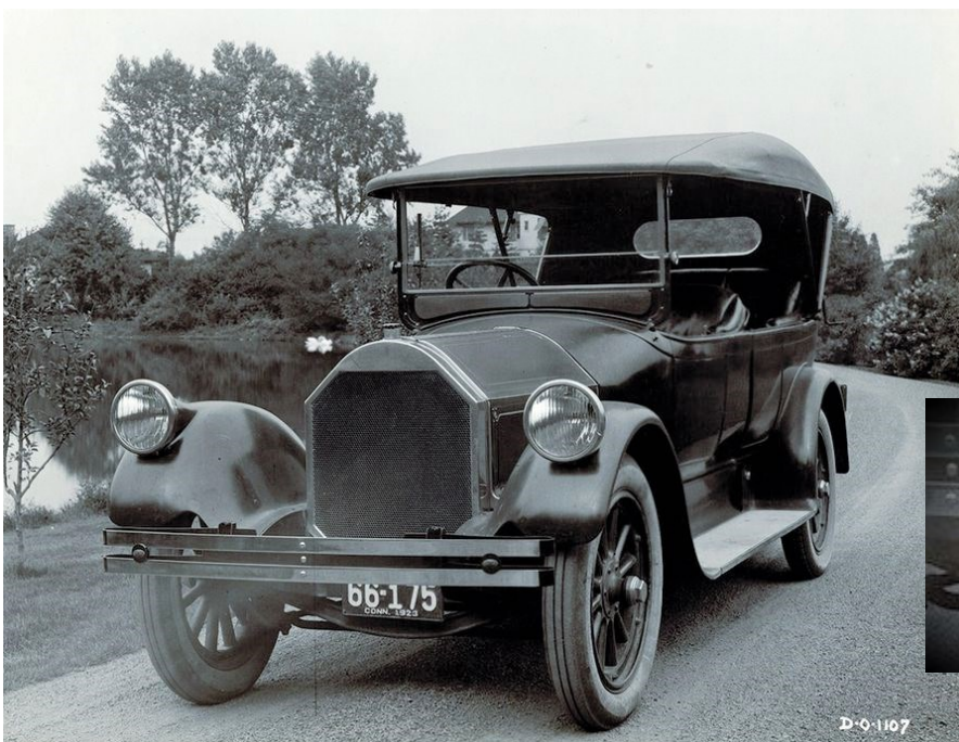
Uncredited period photo from Steven Rossi's Pierce-Arrow archives

The model year of this Pierce-Arrow may not be clear, however, its license plate indicates that it was registered for the road in Connecticut in 1923 ... 100 years ago . Note the steering wheel placement on the right side.