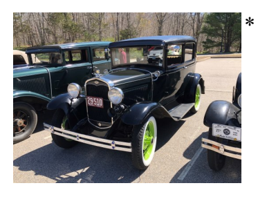
Right - Thank you, Staehly Farms for welcoming BACC to Yankee Cider Co.!