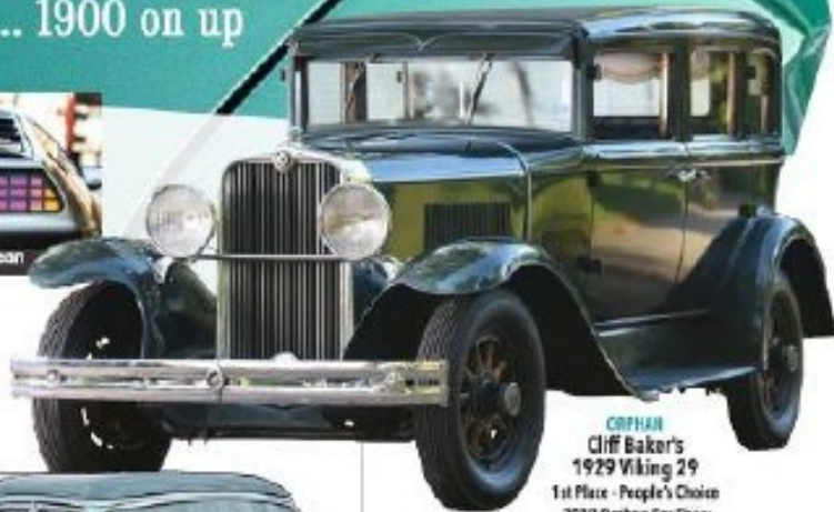
ORPHAN Cliff Baker's 1929 Viking 29 1st Place - People's Choice 2019 Orphan Car Show