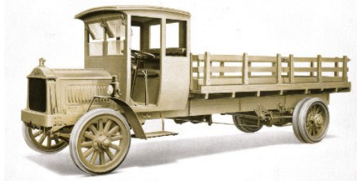
Top Left: Nash wrecker