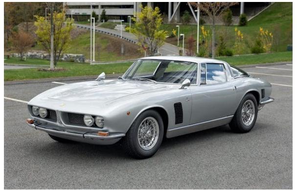
Above: 1967 Iso Grifo