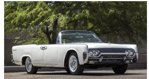
Left to Right, Above: 1949 Kaiser Deluxe (LeMay Collection), 1951 Frazer Manhattan (Mecum Photo), 1961 Lincoln Continental (TopSpeed Photo)