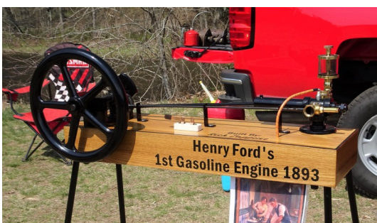
... and Reproductions, too.