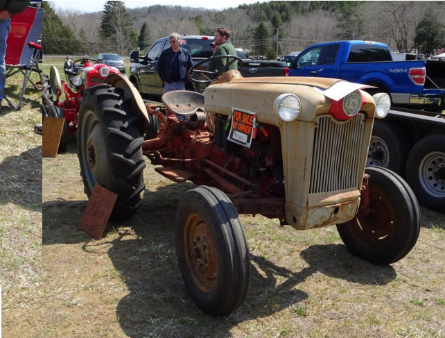
Left and Below: Tractors - Restored, Unrestored and Repurposed