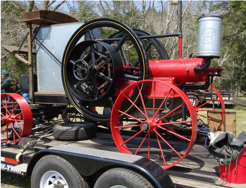
Left and Below: Antique Engines, Large and Small ...