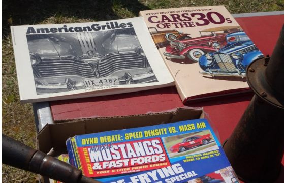
Above and Right: Seen in the Flea Market